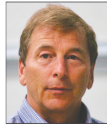
Linwood Branch Incumbent